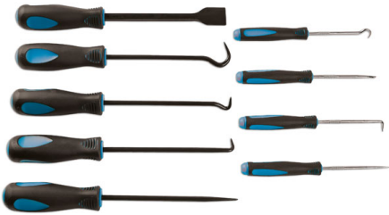
Pick Hook and Scraper Set 9pc | 6382