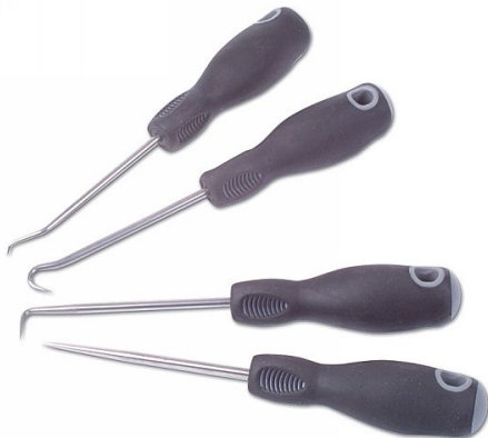
Mini Pick & Hook Set 4pc | 3444